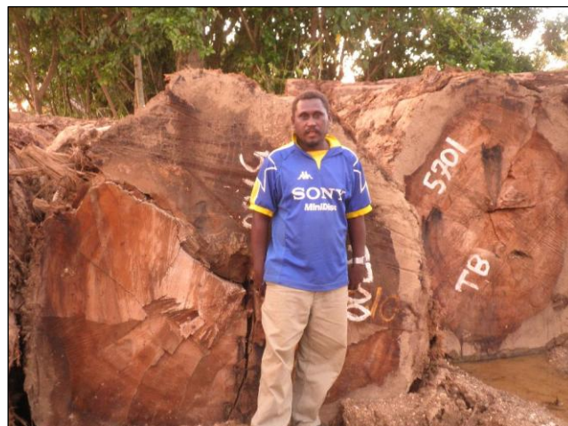
Logs taken from Lot 1 ready to load onto the boat

KIBCA is determined to use Solomon Island environmental laws to prevent logging above 400m. Any further logging above 400m will be challenged in the Courts.