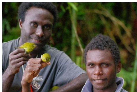
KIBCA trainees assist the scientific team with netting and recording the endemic Kolombangara white eye

In October four scientists joined a five-day expedition to study the summit area of Mt Veve. Using newly cut tracks to the rarely visited summit, the party of 19 made some important new discoveries.