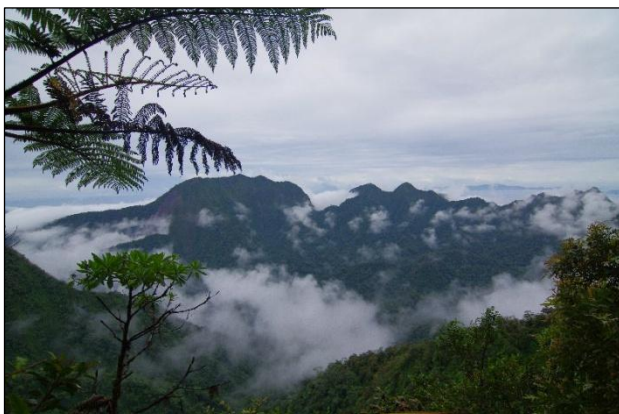
Mt Rano and the Kolombangara crater rim from Mt Veve

The trip also allowed KIBCA staff to describe the trail as part of its promotion of treks to Mt Veve, the Vila River and the forests around Imbu Rano lodge to tourists.